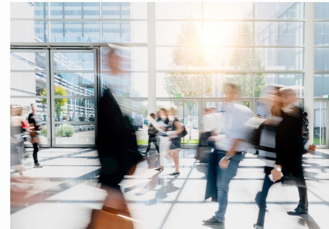
Second Movement: Joyfully Implementing