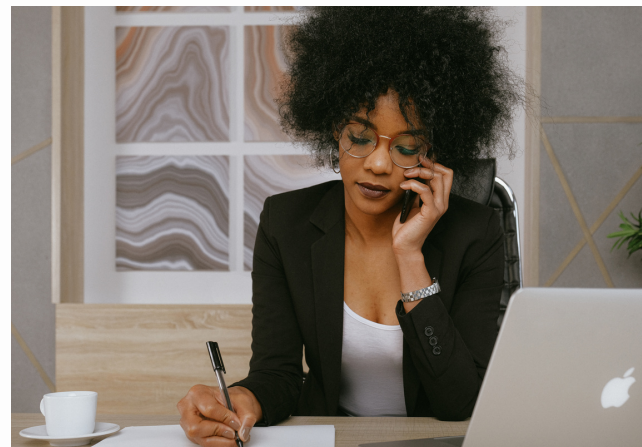
Fourth Building: Momentum & Moments