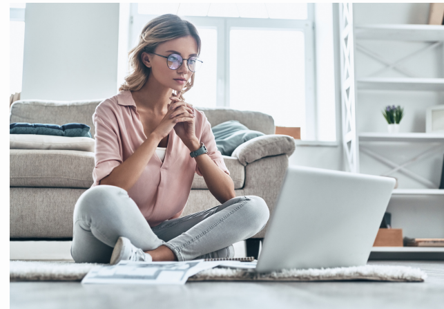
First Steps Taken: Ah-ha Moments