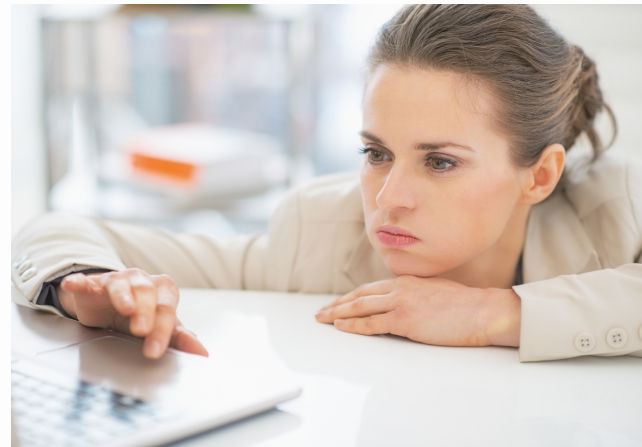
Where You Begin: Frustration, Overwhelm