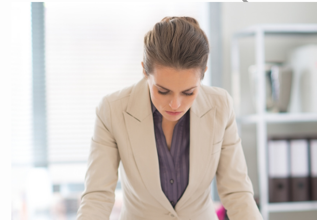
Third Progress: Nervously Adapting