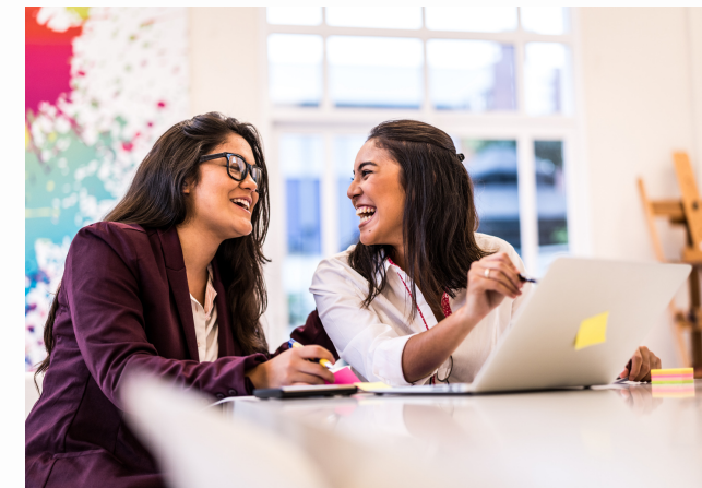
Where You Are Going: Unlimited Possibilities