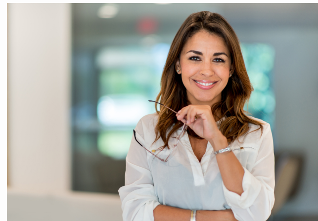
Fifth Growing: Nervously Confident