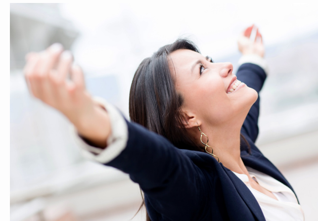
Sixth Achieving: Adjusting Goals